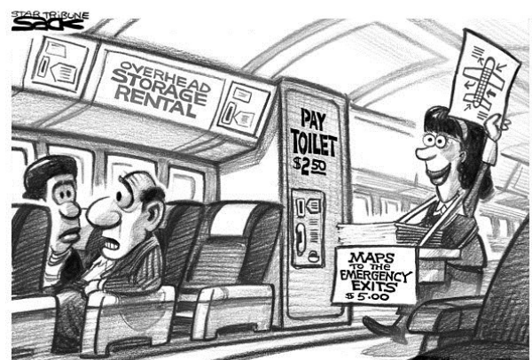
'IT WAS BAD ENOUGH WHEN THEY STARTED CHARGING FOR IN-FLIGHT MEALS ....

Along with everyone else, we are looking with some optimism and a lot of hope that United will